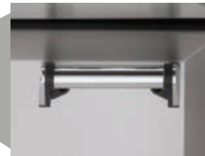
LEGACY 36 DUAL FUEL COOKTOP CLASSIC HANDLE